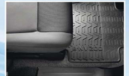
Rubber mat (69, 28)