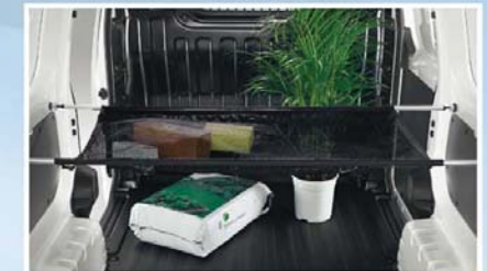
System bars for multi partition net (27)