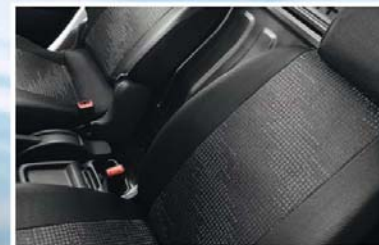
Textile seat covers eco material (60)