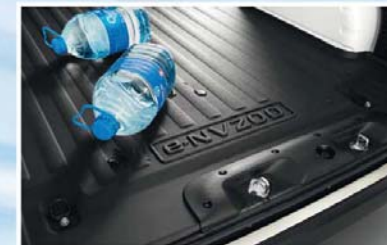
Plastic floor protection and trunk entry guard (43, 11)